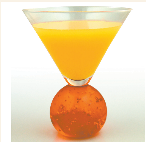
VAN GOGH VODKA

WHAT TO DO WHEN YOU DON'T HAVE TO DO ANYTHING