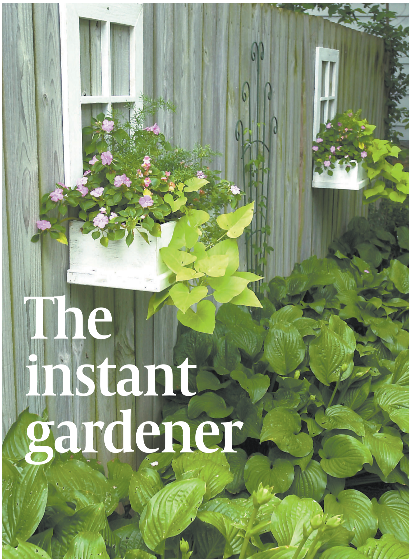
Sweet potato vines are grouped with ferns and impatiens for a gorgeous, unfussy pop of color.