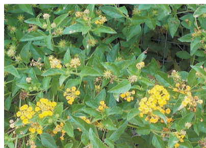
Lantana CYNTHIA MCKINNEY